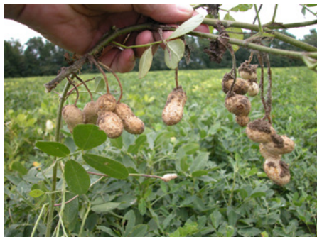
This is a photograph of a peanut plant.

George Washington Carver came up with 105 recipes for using peanuts, including peanut macaroni and cheese!