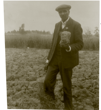
This is a photograph of George Washington Carver when he was 42 years old. He is holding a clump of soil.

He talked about not wasting acorns. He said they could be used to feed farm animals. He also told people to dry, can, and preserve fruits and vegetables. He wanted to help people. He wanted African Americans to eat healthy foods. He wanted to take care of the Earth. George was born more than 150 years ago. His lessons are just as important today.